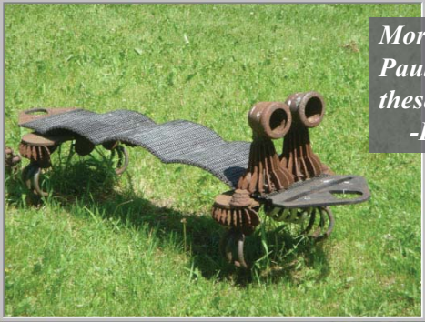
More Pictures from Our 2007 Paul Bunyan Ride - Check out these wild junk sculptures!