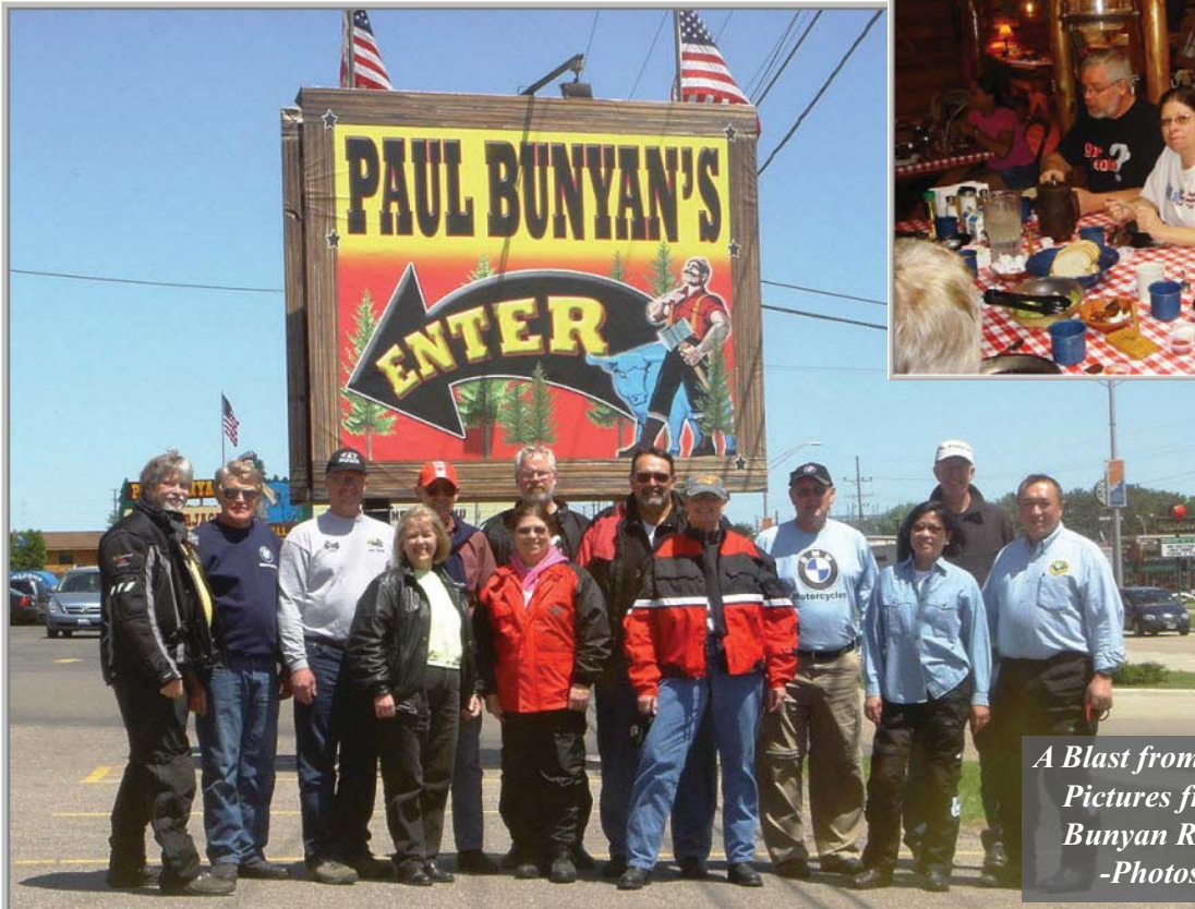
A Blast from the Past! Pictures from Our 2007 Paul Bunyan Ride (pg 1 of 2)