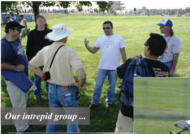
Our intrepid group ...