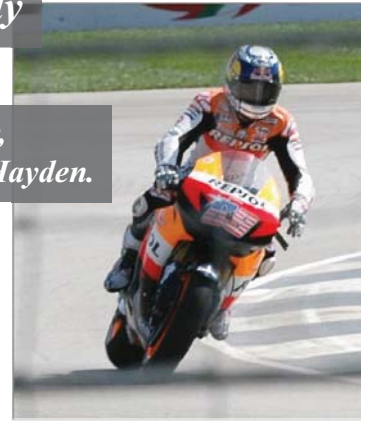
2nd place finisher, American Nicky Hayden.