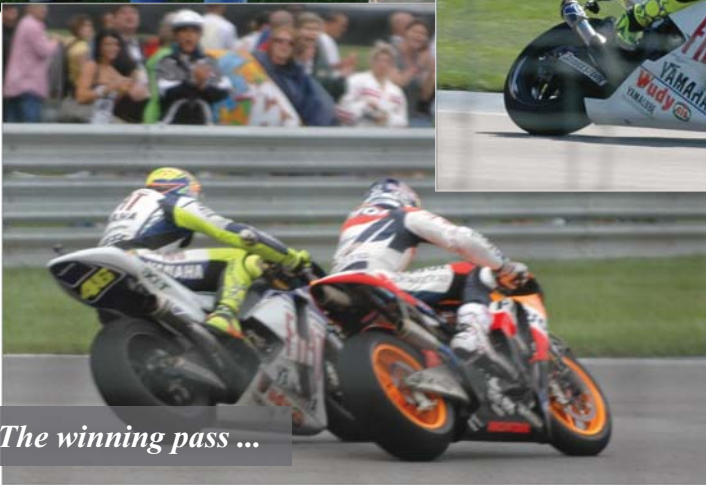
The winning pass ...