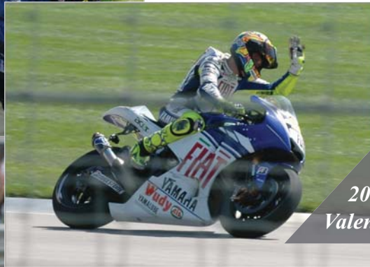
Race winner, and eventual 2008 World Champion, Valentino Rossi.