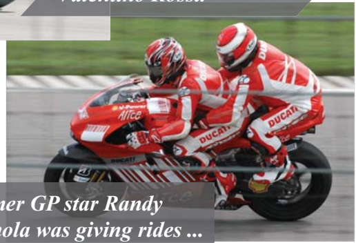
Former GP star Randy Mamola was giving rides ...