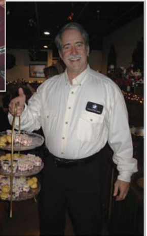
2008 Christmas Party - Part 2 of 2